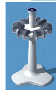
Freely rotatable stand for handy storage of up to 6 Transferpette® S pipettes