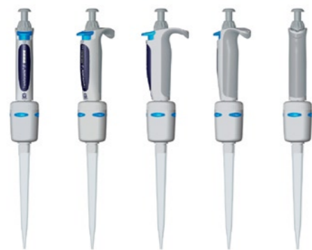
Transferpette® S 10 ml