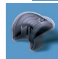
Shelf-rack mount for a single Transferpette® S pipette